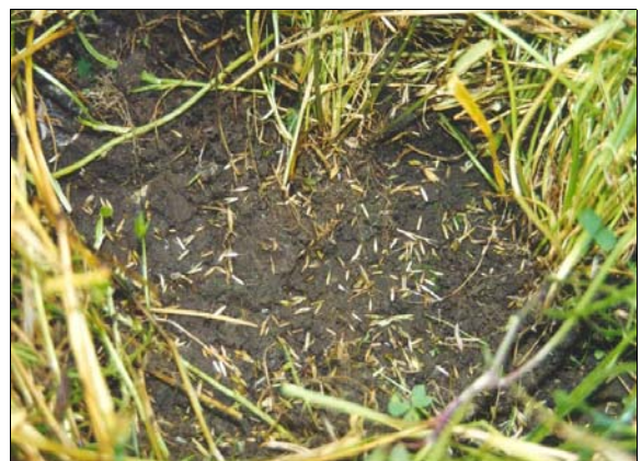
Figure 1: Ryegrass seed containing wild endophyte on the soil surface after making hay. This seed could contaminate a newly sown novel-endophyte-infected ryegrass pasture.

When perennial ryegrass is leafy, the endophyte is concentrated in the leaf sheath, which is at the base of the plant. As perennial ryegrass becomes reproductive from late spring to late summer, the endophyte grows up the elongating stem and into the developing seeds. Mature seed is shed onto the soil surface by the process of natural reseeding (Figure 1). The seed containing the endophyte then germinates and establishes in the pasture. The endophyte cannot be spread from one plant to another.